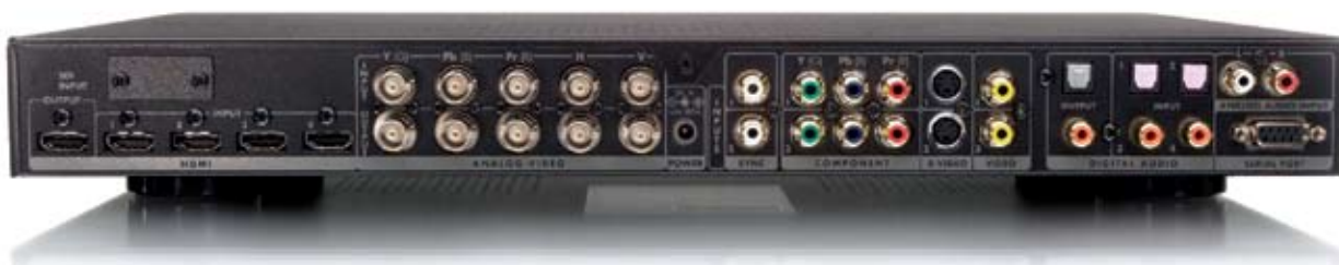
Rear Panel of the DVDO iScan VP50