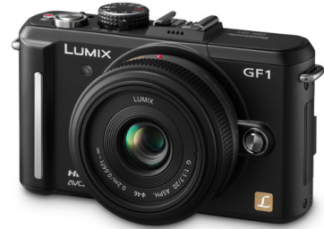
Lumix DMC-GF1C (20mm Lens Kit) - $75

Offer good from 09/26/10 to 10/09/10 (See details below)