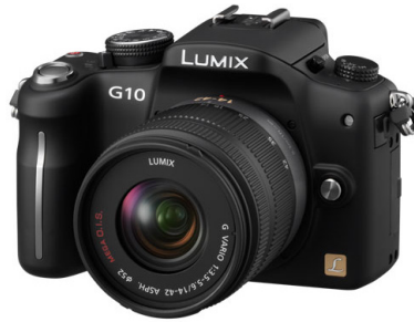
Lumix DMC-G10K (14-42mm Kit) - $100