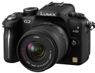
Lumix DMC-G2 (any color) - $75

When you buy a qualifying Panasonic Lumix Camera