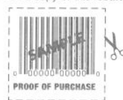
Sample UPC code UPC code is located on the side panel of product packaging.

address to: Time Customer Service, Inc., P.O. Box 62160, Tampa, FL 33662-2160. Customer Service Phone Number: 1-888-474-2457